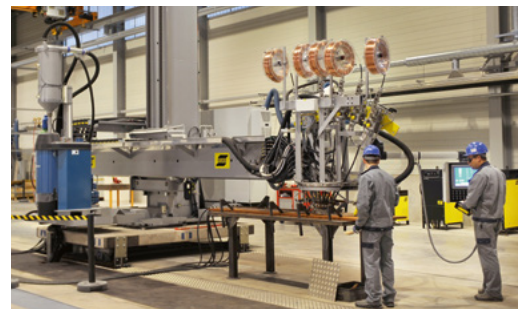
Welding laboratory: Multi-wire Submerged Arc Welding (SAW)

ArcelorMittal's full engineering approach begins with characterisation of materials and continues through to component testing.